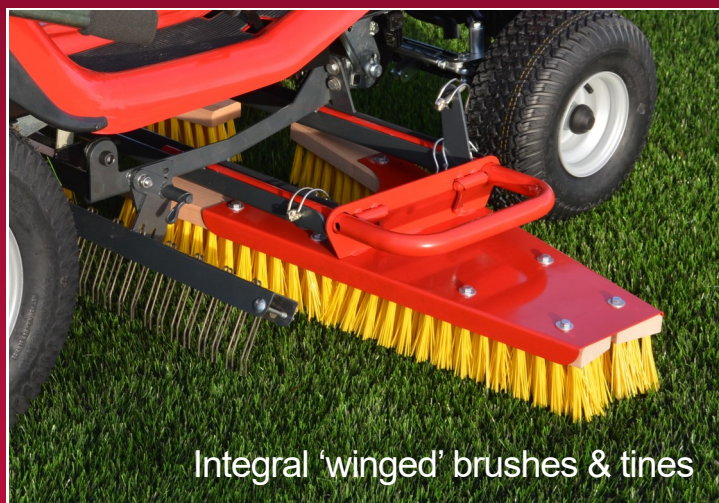
Integral 'winged' brushes & tines

The Drive Unit is exceptionally quiet in operation, low on fuel consumption and very easy to manoeuvre, making it ideal for accessing small areas, yet powerful enough to cope with all your essential routine surface maintenance tasks.