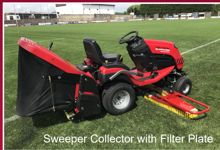
Sweeper Collector with Filter Plate

A set of 'winged' brushes are included for regular day-to-day grooming, simultaneously lifting and cleaning the fibre and infill. The Drive Unit is also equipped with a series of tines for the light decompaction of the infill