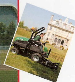
Those ride-ons do the cutting business everywhere see page 8